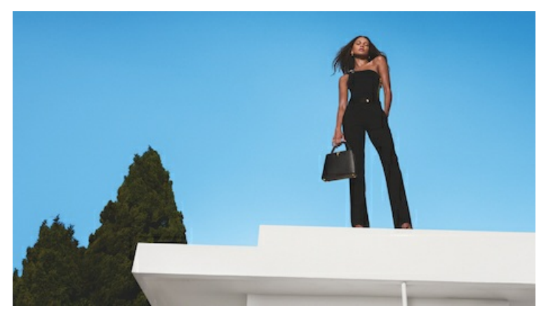
Carrying the home team's Capucines handbag, Zendaya stars in a campaign shot on-site in Cte d'Azur.