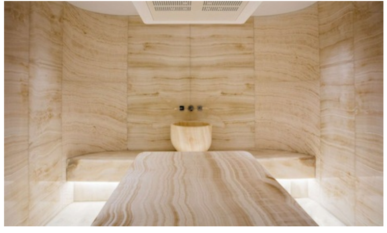
Embedding itself into 150 years of history, Dior's seaside experience has arrived at the iconic Htel du Cap-Eden-Roc.

Rooted in nature, a set of customizable face and body "Dioriginels Rituals" carry titles such as "Escale Eden-Roc" and "Riviera Solar Glow," and hint at Dior Beauty's holistic ethos.