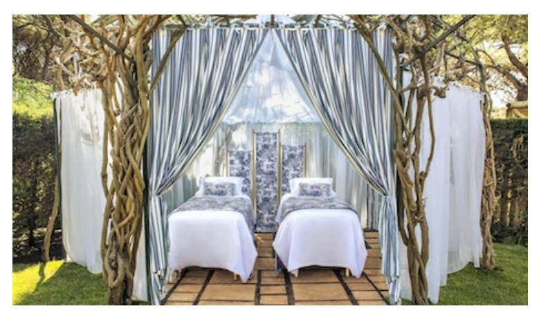
The spa at Htel du Cap-Eden-Roc will remain open through Oct. 15, 2023.