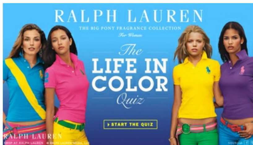
Cover image for Ralph Lauren's The Life in Color Facebook quiz

A short video intro starts the quiz that features the models associated with the fragrance.