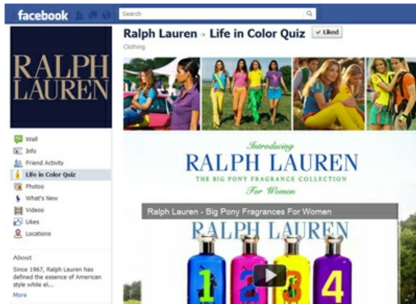
Ralph Lauren's The Life in Color Quiz Facebook page

A short video intro starts the quiz that features the models associated with the fragrance.