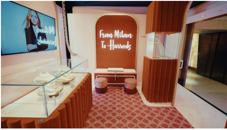
The pop-up's enclaves vary in theme, though precious metals and stones, illuminating screens and playful hues are unifiers.

This final room brings the birthplace of Pomellato to London, uniting the two historic cities with jewels and an embrace of modern marketplaces digital screens cast swirling images of gems and brand visuals amidst the physical designs, glittering in the blue light. This is where the High Jewelry is kept.