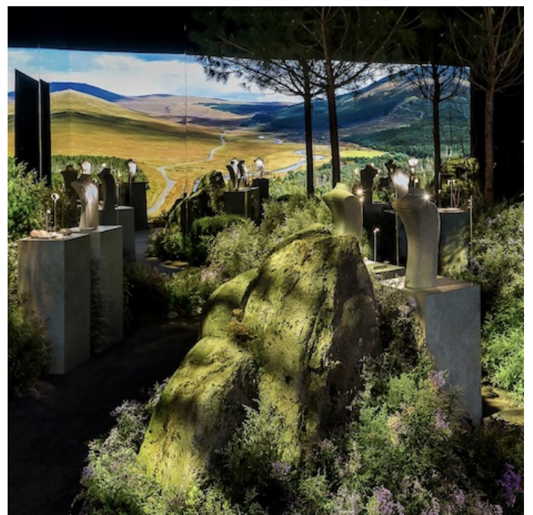
Chanel created an immersive space to present the high jewelry drop.

Named after the river that flows from Scotland into England, tweed is inherently tied to the United Kingdom.