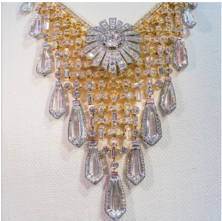
The sun is one of five house codes used for the collection, paired with woven looks to evoke tweed clothing of the Scottish locations that Ms. Chanel herself loved.

The material quickly became a signature of her company.