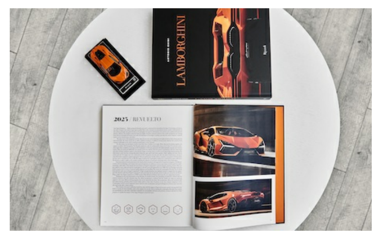
The new edition of "Lamborghini" grants an official recount of its accomplishments.

Filled to the brim with images of cars and events of historical significance to the iconic luxury automaker on highly refined pages, the new volume grants an unparalleled snapshot of what has come before, as well as what is next. The 240-page item's English translation will be released on October 10, 2023, retailing for $85.