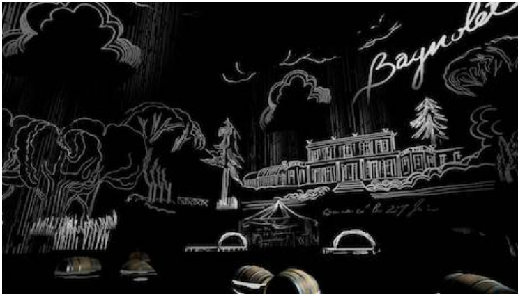
Richard Hennessy's sketches guide guests through the sensorial experience.

For the Heritage Days event, free guided tours will be available from Sept. 16 to 17 from 12 p.m. to 7 p.m.