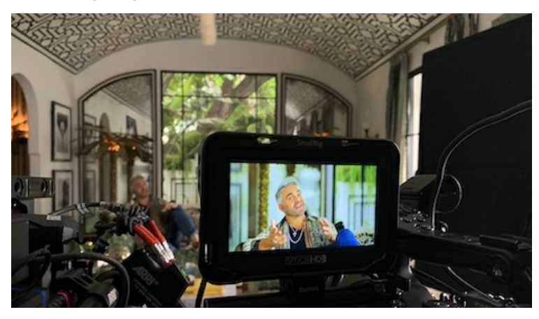
Directed by American filmmaker Kate Novak, "AD100: The New Taste" continues the outlet's focus on long-form video content.