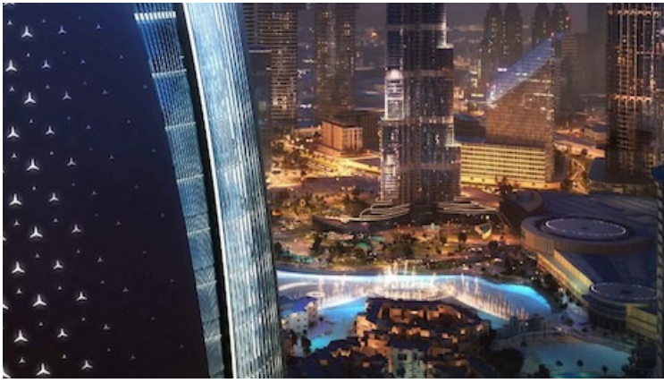
Future residents are promised unobstructed views of the Burj Khalifa skyscraper and nearby entertainment options.

Smart home technologies and intelligent mobility solutions will offer convenience, enhancing modernity within interior units. Future residents are promised unobstructed views of the Burj Khalifa skyscraper, the world's tallest building.