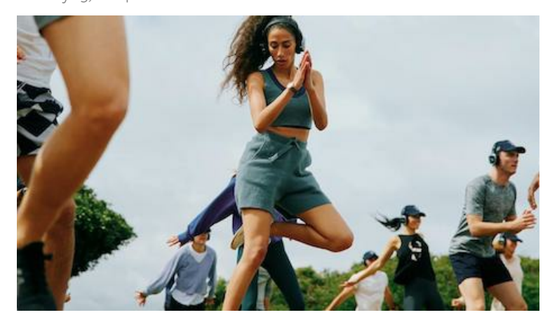
From Napa Valley to New England, guests will be able to book weekends dedicated to health.