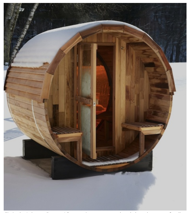
Fittingly, Auberge Resorts' Connecticut property already has elements of wellness woven into the footprint, such as outdoor saunas.

The first retreat will occur at Stanly Ranch in Napa Valley from Jan. 26 to Jan. 28, followed by Commodore Perry Estate in Austin from March 27 to March 29. From June 21 to June 23, the series will move to Mayflower Inn and Spa in Washington, Connecticut.