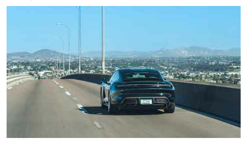
Test drives were carried out last week between Los Angeles and San Diego on Interstate Highways 405 and 5.