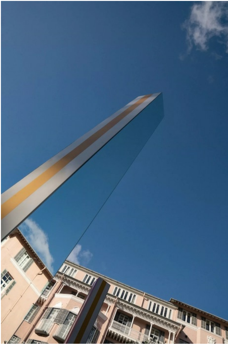
The South African site uses glass and color to reflect the environment and architecture.

The painter, sculptor and conceptual artist is no stranger to luxury, having worked with prestige houses, such as Louis Vuitton ( see story ), previously.