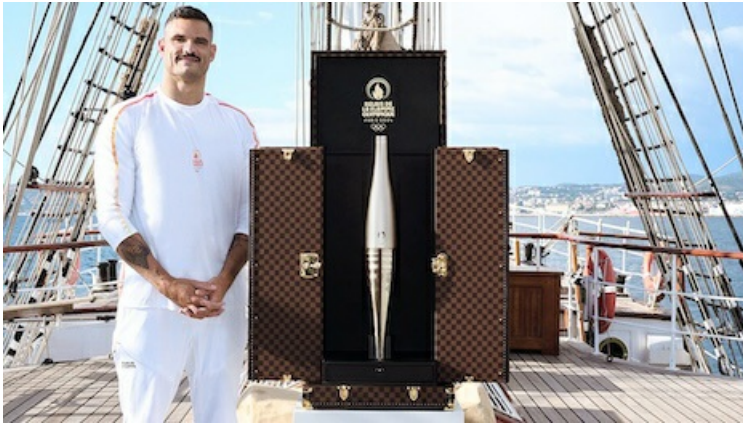
The Olympic flame arrived in Marseille, France this week, on May 8.