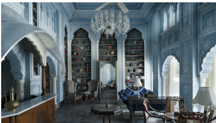
Drinks made with garden-grown herbs at a literary-themed bar add to a diverse array of dining options.

With orange liqueur, pineapple juice, lime, bitters, Indian dry gin and herb liqueur, the updated version's pink tint nods to Jaipur's colorful nickname.