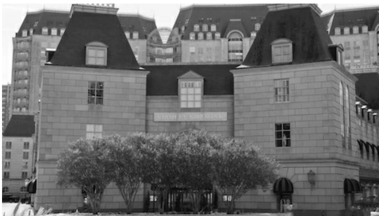
The Lone Star landmark is entering a new era.