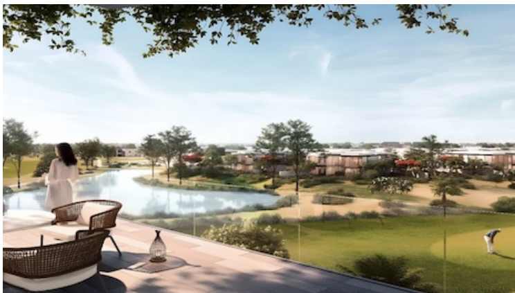
The property will also feature food-focused, interactive agricultural programs.

The Mandarin Oriental Jumeirah Golf Estates will house six dining venues, including two within the golf clubhouse and the Halfway Hut just off the green. The remainder involve existing gastronomy concepts from across the hospitality brand's global portfolio.