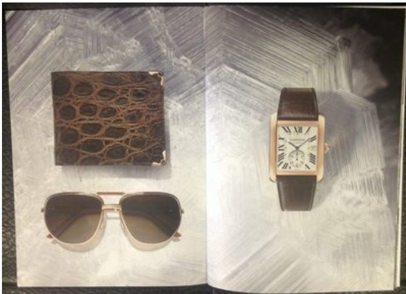
Cartier credit card wallet, limited edition sunglasses and a Tank MC collection watch

Although the main focus of the catalog was Cartier's fine-jewelry collections for women, it also featured clutches, wallets, sunglasses and a fountain pen. Men's gifts are well represented in the catalog with cufflinks, leather wallets and watches ranging in price from $6,600 to $87,000.